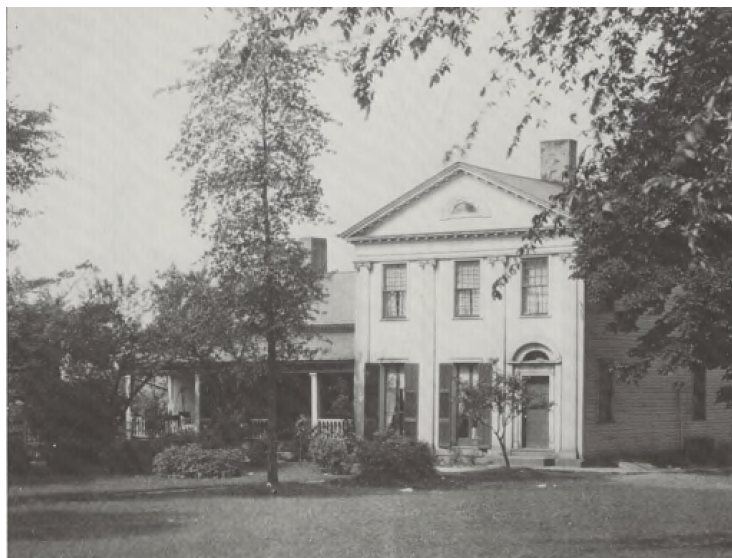
Baldwin-Buss-Merino House (1825) is one of the homes whose full research report can now be found on the HHA website.

Hudson Heritage Association has digitized and uploaded to its website its collection of house reports, which document the homes and other structures that have been awarded iconic HHA Historic Markers. These reports offer rich and deeply researched information on land ownership, architecture, construction of homes/additions, commerce, religion and important biographical information on the owners and occupants of more than 160 historic homes in Hudson built from 1806 to the early 20th century.