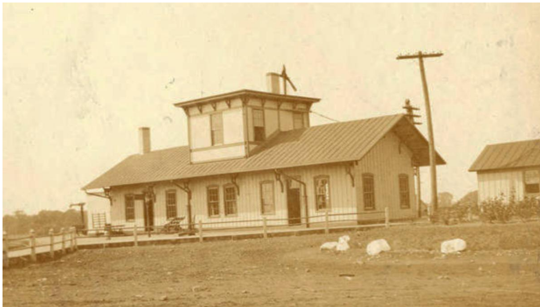
Hudson's Pennsylvania Railroad Depot, photographed 100 years ago in 1920. Despite efforts to save the historic structure, the depot was demolished in 2013.