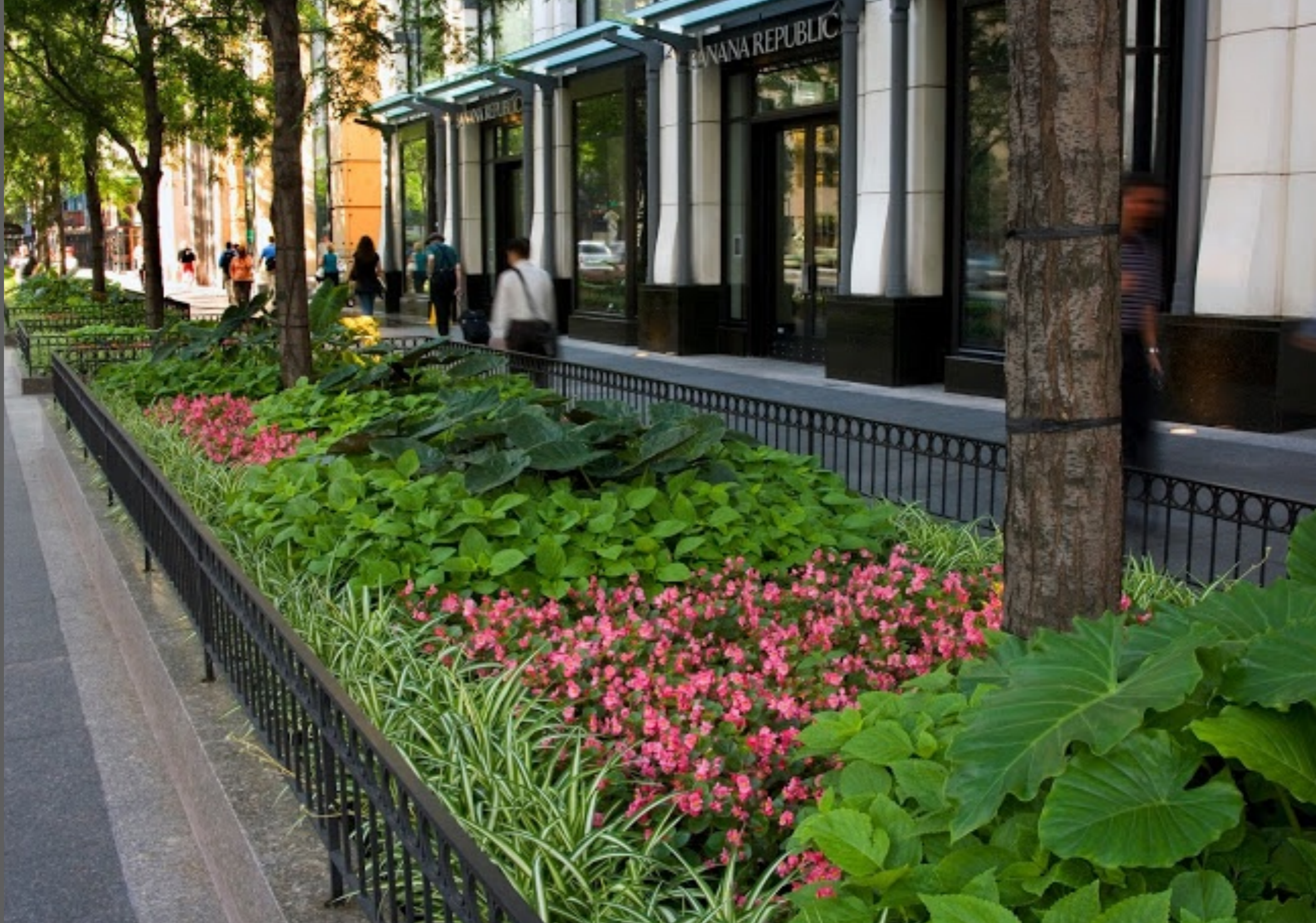
Historic Business District and First & Main