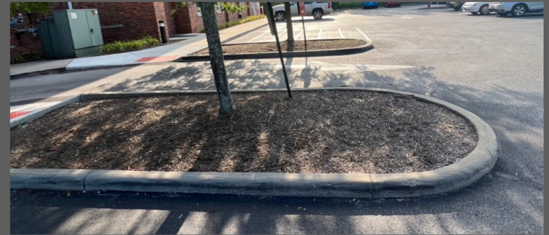
CLOCKWISE FROM LEFT: SIDE OF PARKING GARAGE, WALKWAY TOWARDS HEINEN'S, ISLANDS IN HLHS PARKING LOT