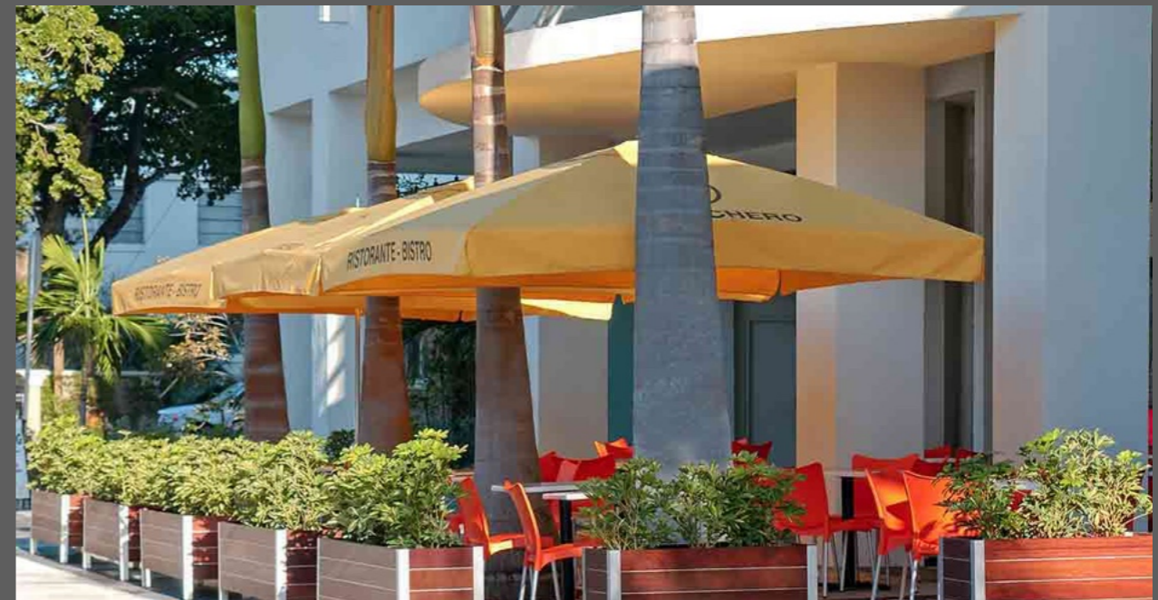
Historic Business District and First & Main