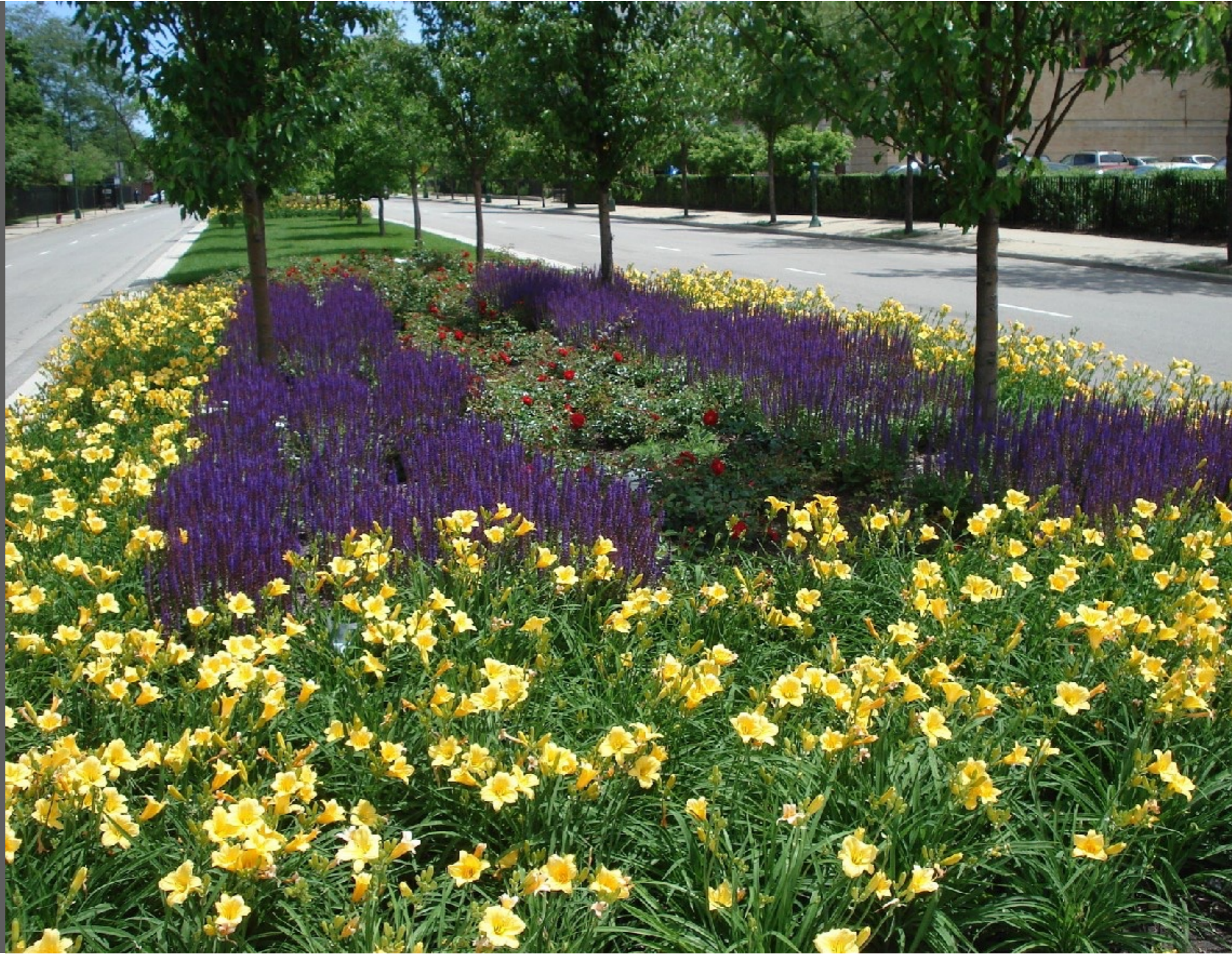
Historic Business District and First & Main