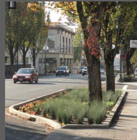
Historic Business District and First & Main