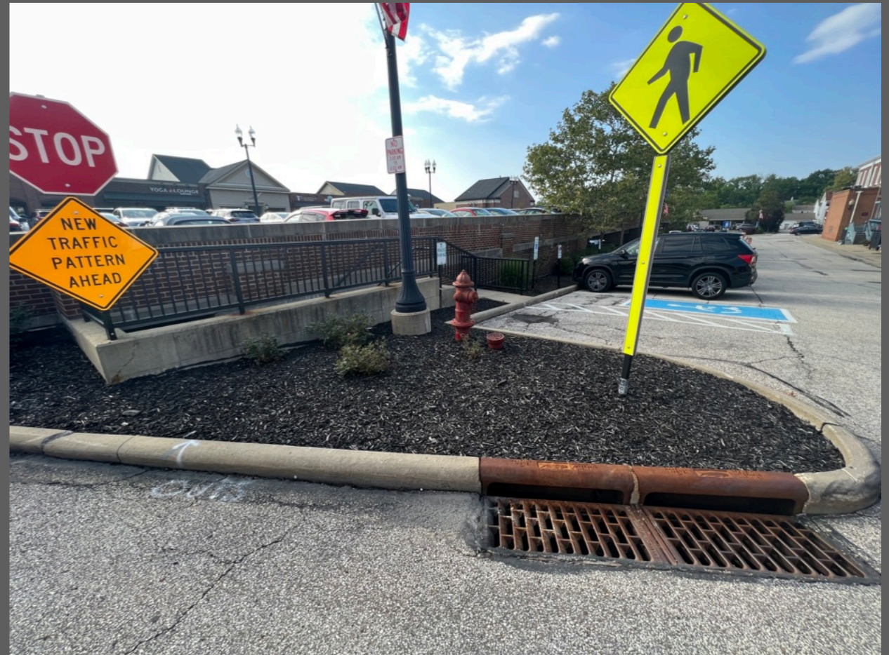
CLOCKWISE L TO R: LIBRARY STREET, ISLAND NEAR PARKING GARAGE, SOUTH FACADE OF HEINEN'S