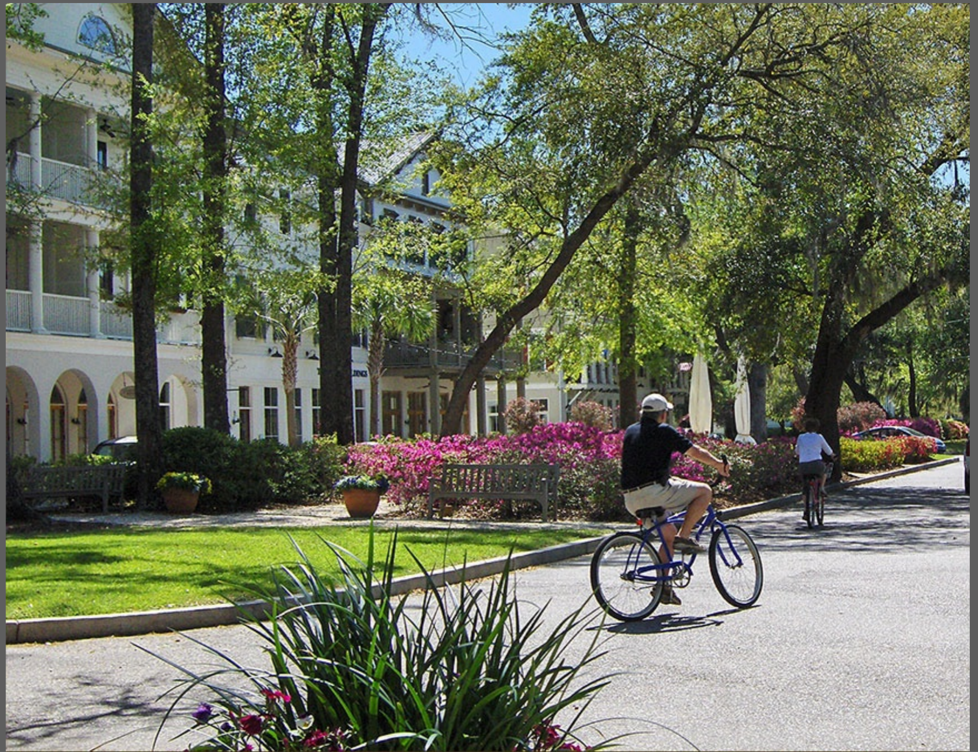
Historic Business District and First & Main