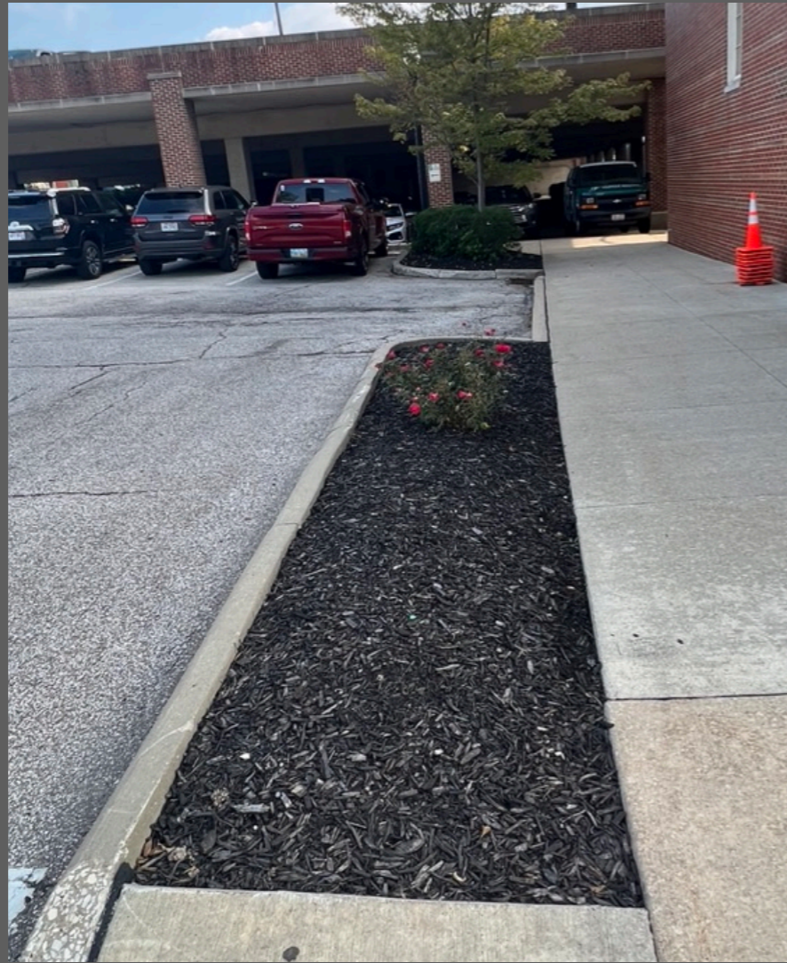
L TO R: EMPTY BED EAST OF FLORAL SHOP AND CORNER OF LIBRARY AND VILLAGE WAY STREETS.