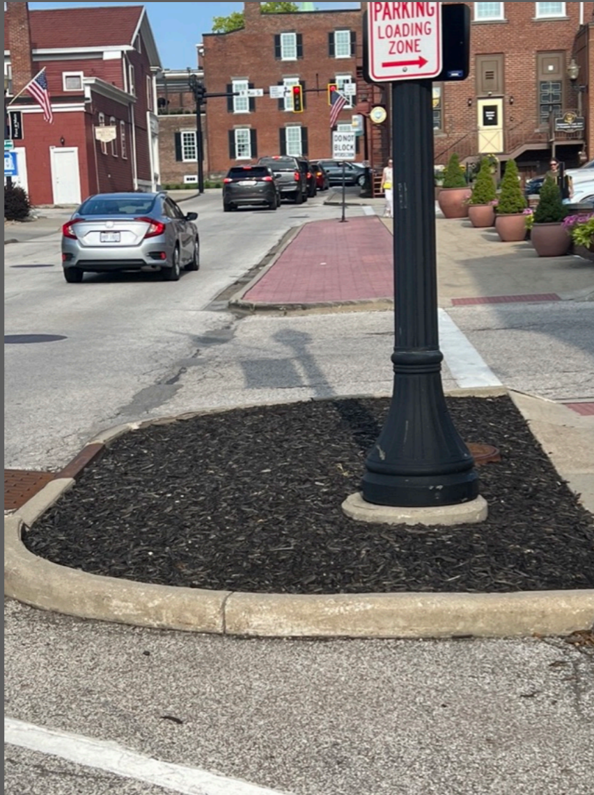
L TO R: LOOKING EAST DOWN CLINTON STREET AND NORTH ON LIBRARY STREET.