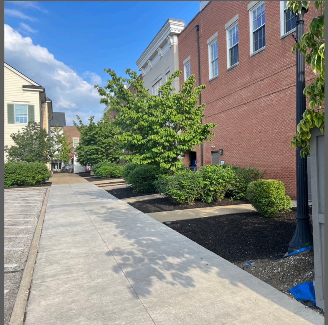
L TO R: VIEW FROM LIBRARY STREET AND WALKWAY NORTH OF FLIP SIDE

Historic Business District and First & Main