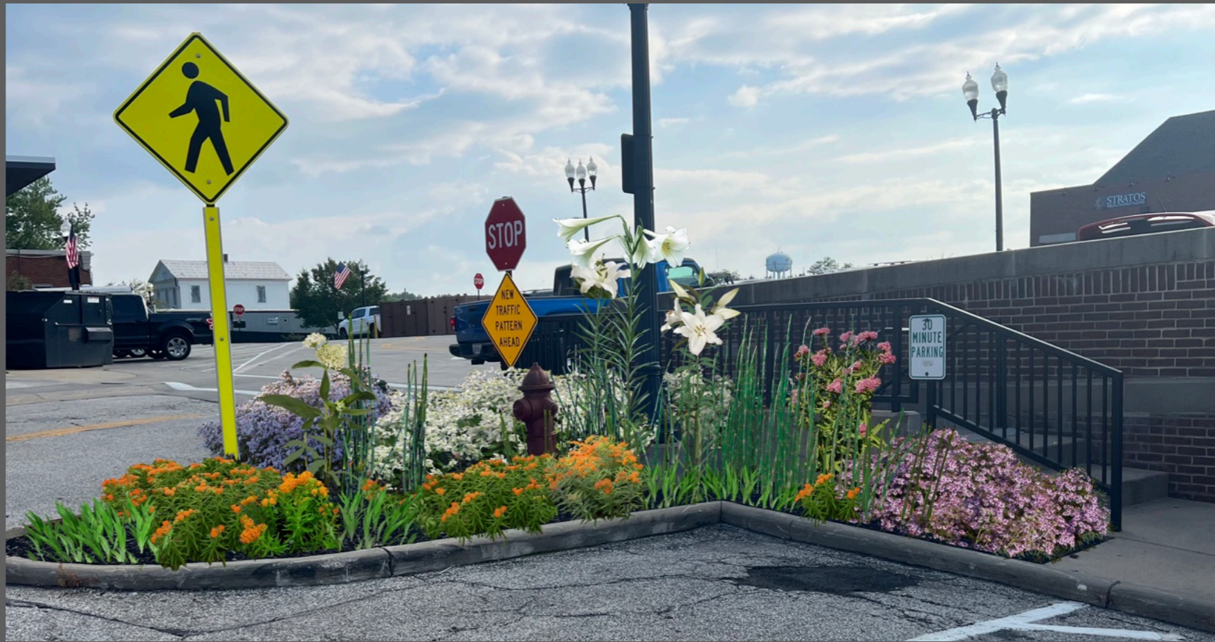
Historic Business District and First & Main