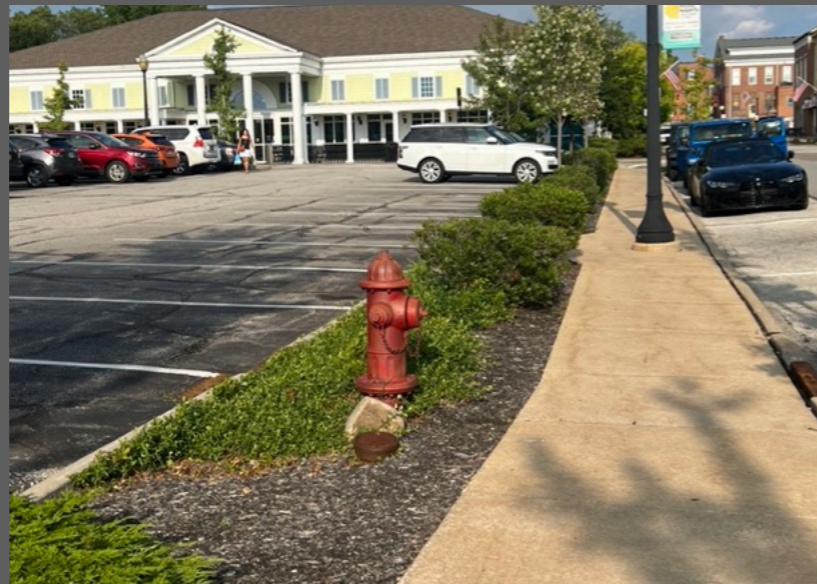
Historic Business District and First & Main