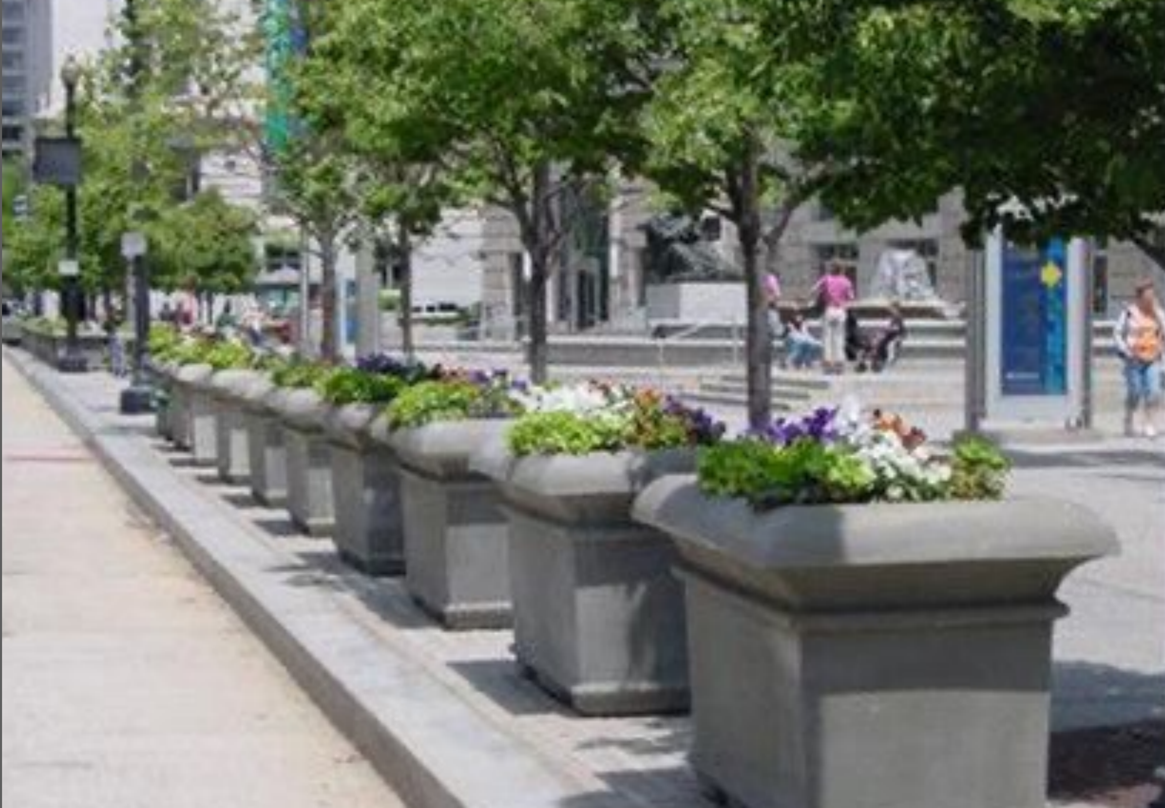
Historic Business District and First & Main